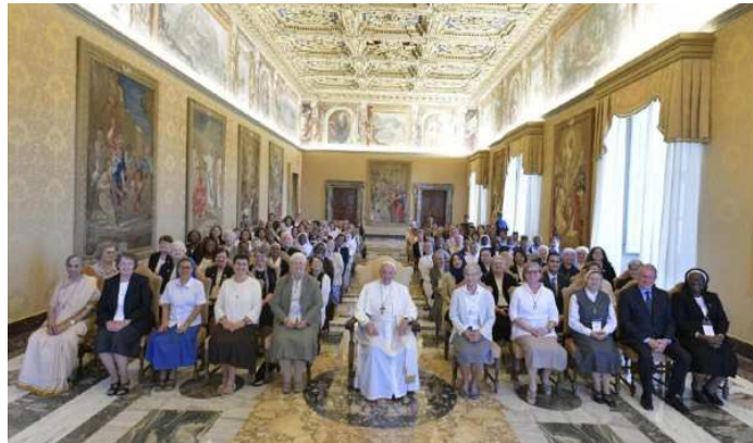
TK Assembly participants with Pope Francis.