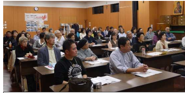
TK Japan Seminar in Sapporo

Talitha Kum Japan organized the second awareness campaign seminar against trafficking in persons this year. This seminar was held in the Sapporo Diocese Catholic Center at Sapporo, Hokkaido (Northern part of Japan) on October 5, 2019. The theme of this seminar was "Human Trafficking in Japan and Church Support Activities ~The Situation of Vietnamese Technical Intern Trainees". There were about 70 people who attended the seminar. The main purpose was to provide information about trafficking in Japan and the situation and support of the church to the rapidly increasing Vietnamese technical intern trainees in the Sapporo Diocese.