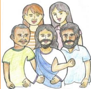
主イエスも難民だった Lord Jesus was also a refugee